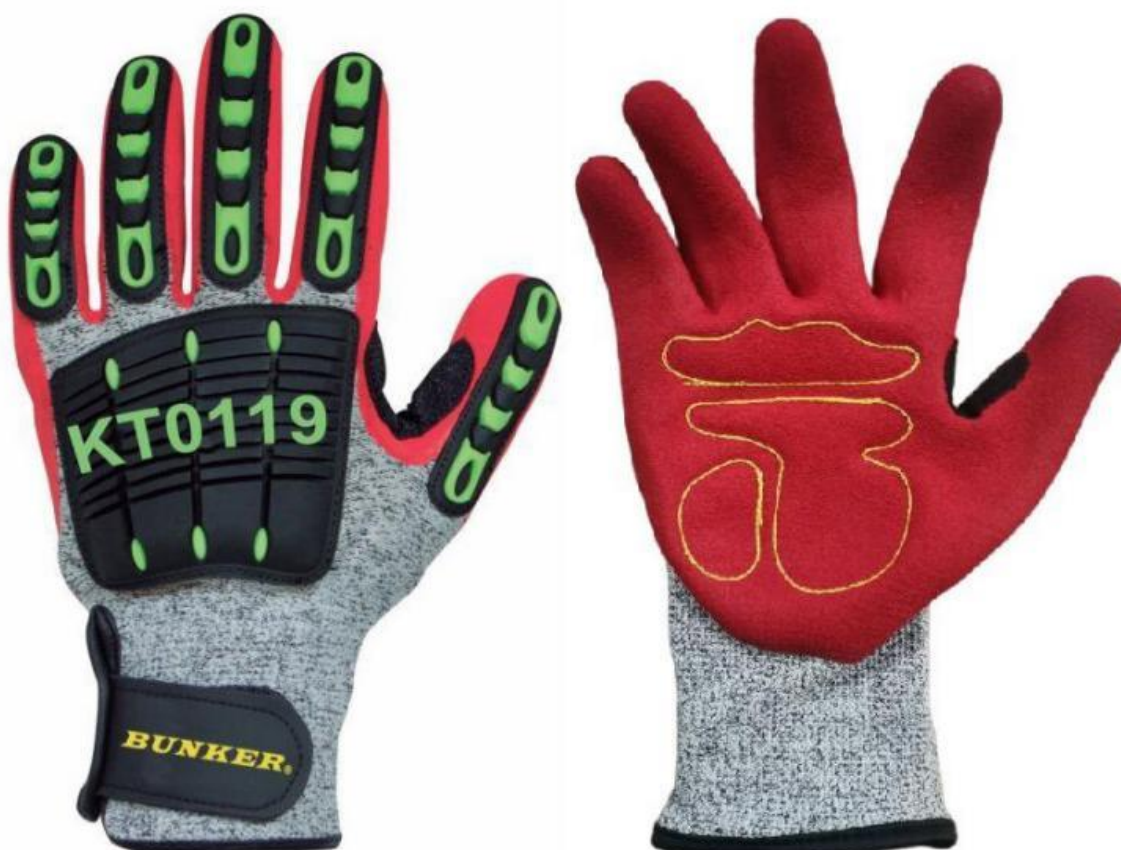
Picture 1: Gloves back with marking, knitted seamless anticut liner, microfoam sandy nitrile coated gloves, with sewn palm absorber, reinforced thumb crotch, TPR overlays+velcro closure